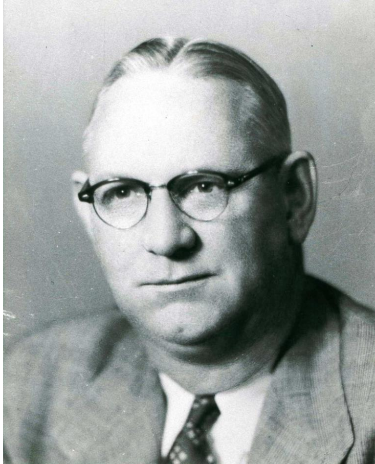
Founder of the Ohio Chapter The First Chapter of the National Shade Tree Conference 1942